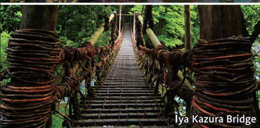
Iya Kazura Bridge