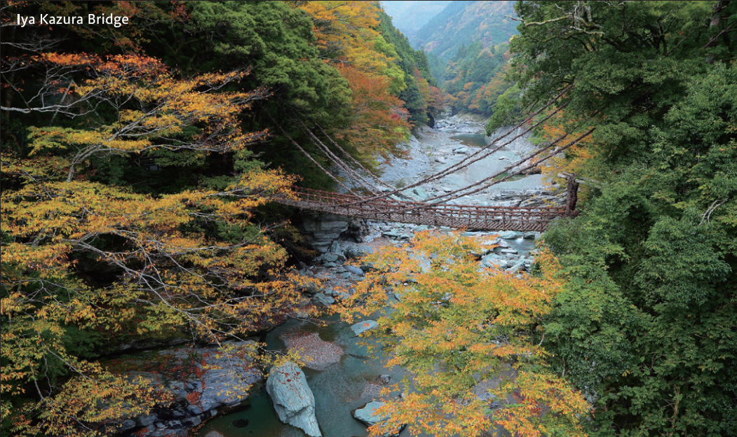
Iya Kazura Bridge