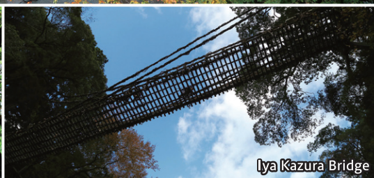
Iya Kazura Bridge