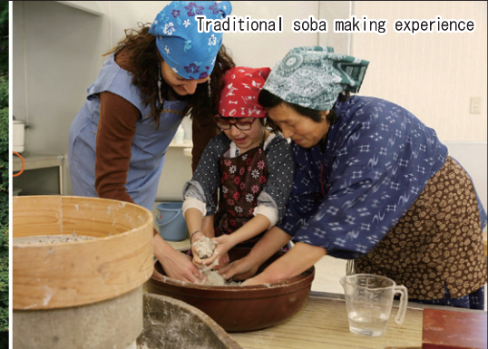
Traditional soba making experience