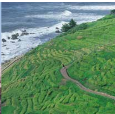
Senmaida Rice Terraces

Kanazawa: Samurai culture lives on in the heart of Ishikawa.